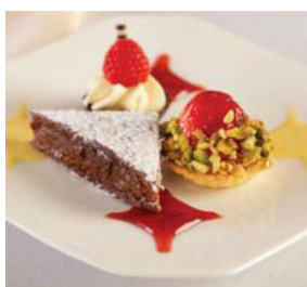
Assorted Petite Desserts (above right), Plated Dessert Trio (above), Golden Carrot Torte (below)

Please check with your Catering Sales Manager regarding multiple dessert policy and fee, as well as any minimums that may apply.