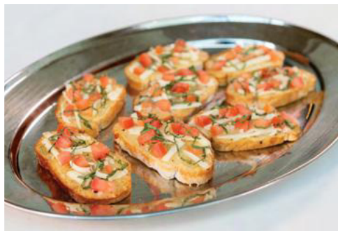
Antipasto Skewers (above right) and Roasted Garlic & Wisconsin Cheddar Bruschetta (above)

G: Gluten Sensitive except as noted VG: Vegan