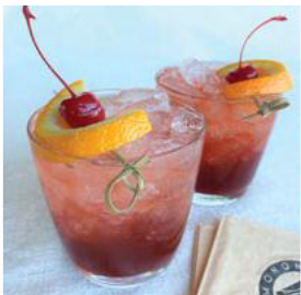
Traditional Old Fashioned

Endless soft drinks from the bar. Groups up to 250 guests $495.00 package price