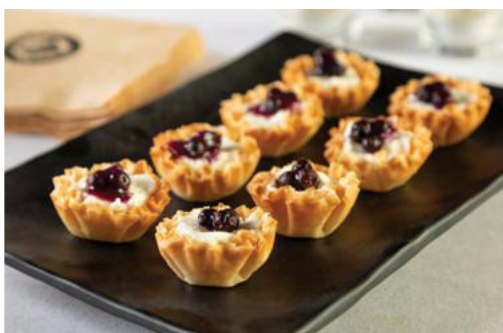
Moroccan Glazed Salmon Skewers (above right) and Blueberry Goat Cheese Tartlets (above)