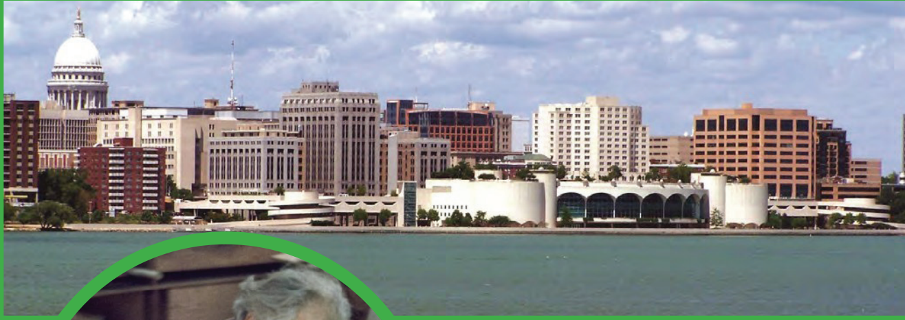
Above: Monona Terrace Community and Convention Center completed 1997