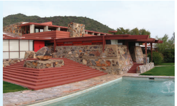
Photo: Taliesin West, Scottsdale, Arizona

For his home and studio buildings in Arizona, Wright designed concrete walls embedded with colorful rock found on the desert floor. He often chose local materials to make a structure look like it belonged in its environment.