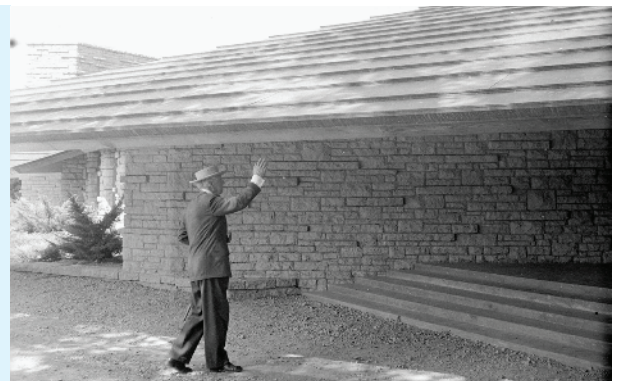
Photo: Unitarian Meeting House, Madison, Wisconsin

Wright designed buildings with a human scale and low ceilings that created a feeling of shelter, as shown here at the entrance to the Unitarian Meeting House. Sometimes this more confining space introduces you to a larger one with higher ceilings and big windows so that the feeling of freedom is more powerful!