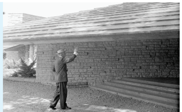
Photo: Unitarian Meeting House, Madison, Wisconsin

Wright designed buildings with a human scale and low ceilings that created a feeling of shelter, as shown here at the entrance to the Unitarian Meeting House. Sometimes this more confining space introduces you to a larger one with higher ceilings and big windows so that the feeling of freedom is more powerful!