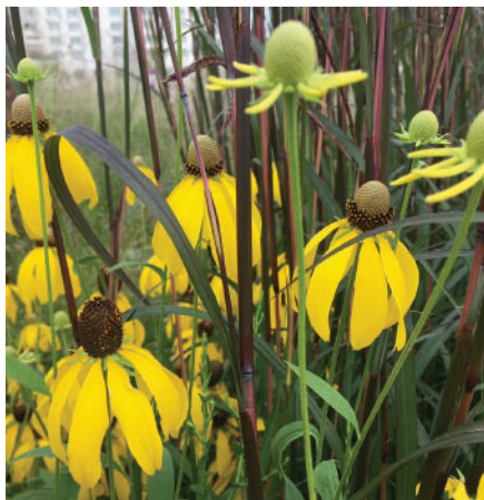
GREY-HEADED CONEFLOWER ( Ratibida pinnata )