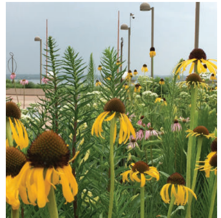
YELLOW CONEFLOWER ( Echinacea paradoxa )