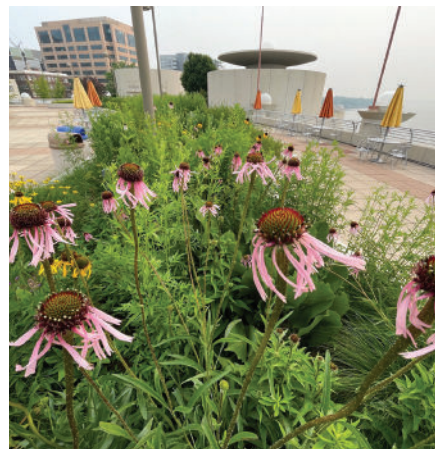
PALE PURPLE CONEFLOWER ( Echinacea pallida )