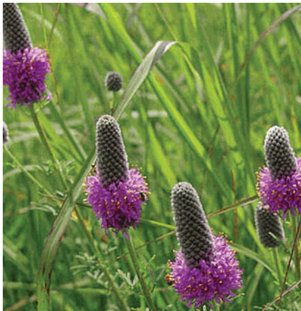
PURPLE PRAIRIE CLOVER ( Dalea purpurea )