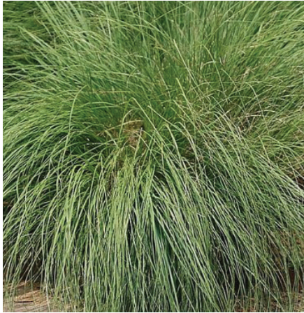
PRAIRIE DROPSEED ( Sporobolus heterolepus )