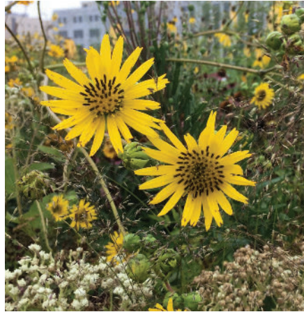
PRAIRIE DOCK ( Silphium terebinthinaceum )