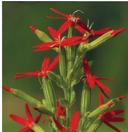
ROYAL CATCHFLY ( Silene regia )