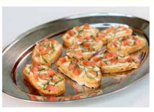
Antipasto Skewers (above right) and Roasted Garlic & White Cheddar Bruschetta (above)

G: Gluten Sensitive except as noted VG: Vegan