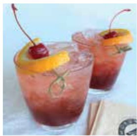
Traditional Old Fashioned

Tito's Vodka, Korbel Brandy, Tanqueray Gin Jack Daniel's Whiskey Bacardi Rum, Captain Morgan Spiced Rum Johnnie Walker Red Scotch Jose Cuervo Tequila Jim Beam Bourbon Rising Shores® Wines: Chardonnay, Pinot Grigio, Sauvignon Blanc, White Zinfandel, Merlot, Cabernet Sauvignon