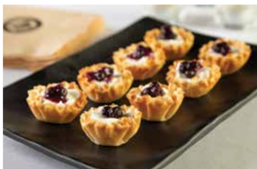
Moroccan Glazed Salmon Skewers (above right) and Blueberry Goat Cheese Tartlets (above)