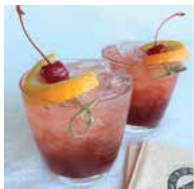
Traditional Old Fashioned

Endless soft drinks from the bar. Groups up to 250 guests $475.00 package price