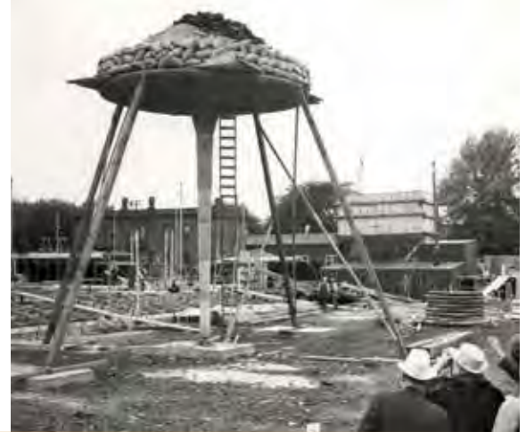
Photo: Construction site of S.C. Johnson Administration Building, Racine, Wisconsin

Wright designed tall, thin columns to support the weight of the ceiling of the Johnson Wax Company's Great Workroom of the Johnson Wax Headquarters. He was required to test one first – it successfully supported 60 tons, much more than the 12 tons required. These columns were referred to as “dendriforms” because of their tree-like appearance. The supporting pads on top were called lily pads.