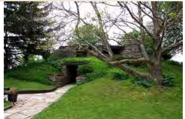
Photo: Jacobs II Residence, Madison, Wisconsin

Wright incorporated native materials and natural land features into his designs so that his buildings would “blend in” with their surroundings. Today's architects continue to practice “green” architecture by choosing materials and construction methods that are energy efficient and less harmful to the environment.