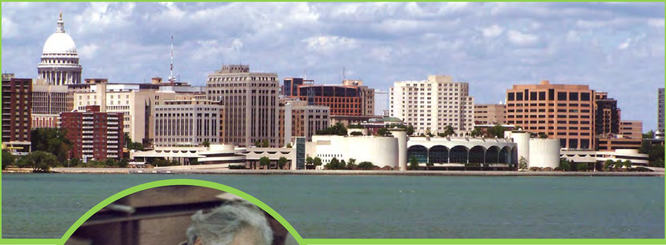
Above: Monona Terrace Community and Convention Center completed 1997