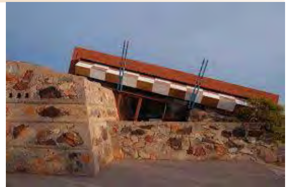
Photo: Taliesin West, Scottsdale, Arizona

For his home and studio buildings in Arizona, Wright designed concrete walls embedded with colorful rock found on the desert floor. He often chose local materials to make a structure look like it belonged in its environment.