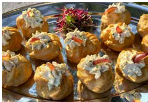
Antipasto Skewers (above right) and Tarragon Chicken Profiteroles (above)

G: Gluten Sensitive except as noted VG: Vegan