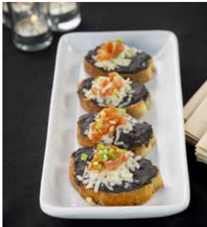
Jerk Chicken Skewer with Mango Salsa (above right) and Black Bean Mollete (above)

G : Gluten Sensitive except as noted VG : Vegan