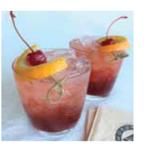
Traditional Old Fashioned

Tito's Vodka, Tanqueray Gin, Korbel Brandy, Jim Beam Bourbon, Jack Daniel's Whiskey, Johnnie Walker Red Scotch, Bacardi Rum, Captain Morgan Spiced Rum, Jose Cuervo Tequila Rising Shores® Wines: Chardonnay, Pinot Grigio, Sauvignon Blanc, White Zinfandel, Merlot, Cabernet Sauvignon