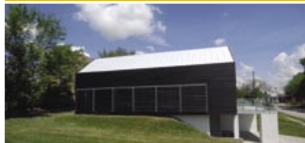
Prescott Passive House by Rockhill and Associates, Kansas City