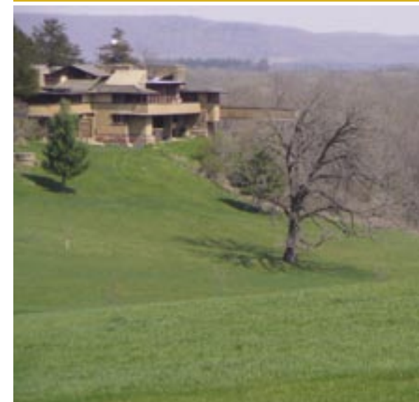
Frank Lloyd Wright’s “Taliesin,” Spring Green, WI

The lecture series is sponsored by Southwest Chapter AIA Wisconsin, Monona Terrace, and Frank Lloyd Wright® Wisconsin.